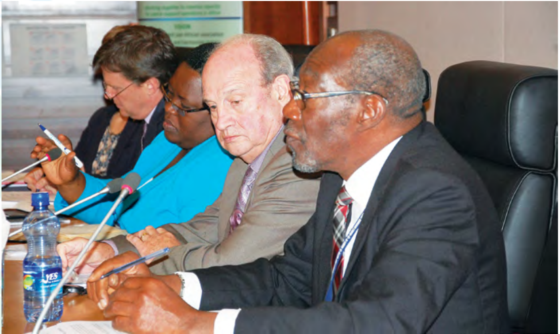
Session on Views from Key Stakeholders