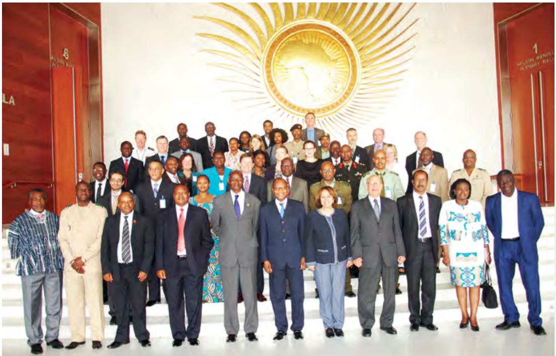
Group photo: 12 th Conference and AGM

In accordance with its new tradition, dating back to the 10 th AGM (Harare, Zimbabwe, 5-6 September 2012), the 12 th Conference and AGM featured a 2-day conference (8-9 December) and a closed meeting of APSTA members (10 December). This format realigns the event with that of the IAPTC, of which APSTA is the African Chapter.