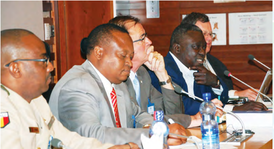
Session on Training to Protect