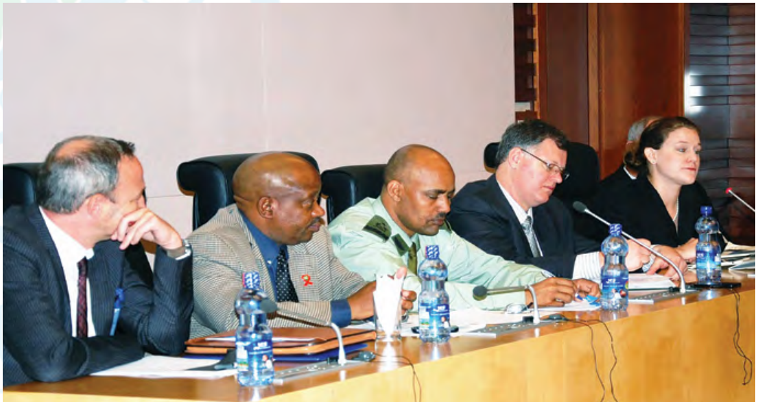
Session on Special Training Issues