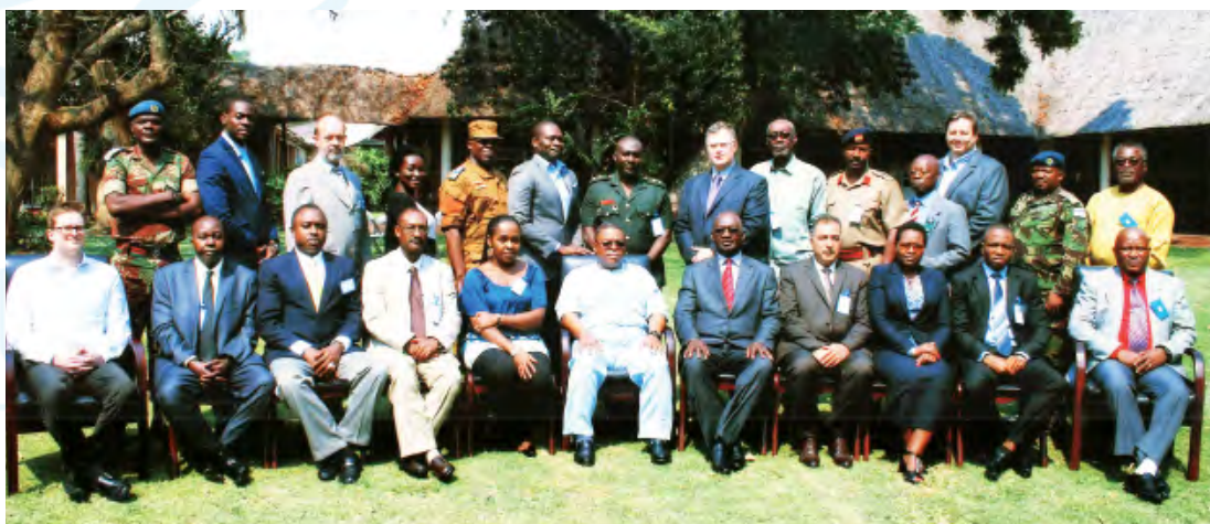
Integrated Mission Planning Training Harmonisation Workshop, Harare, September-October 2014

The SADC RPTC in Harare, hosted the workshop, from 29 September – 3 October 2014. It was attended by 23 Mission Planning and Mission