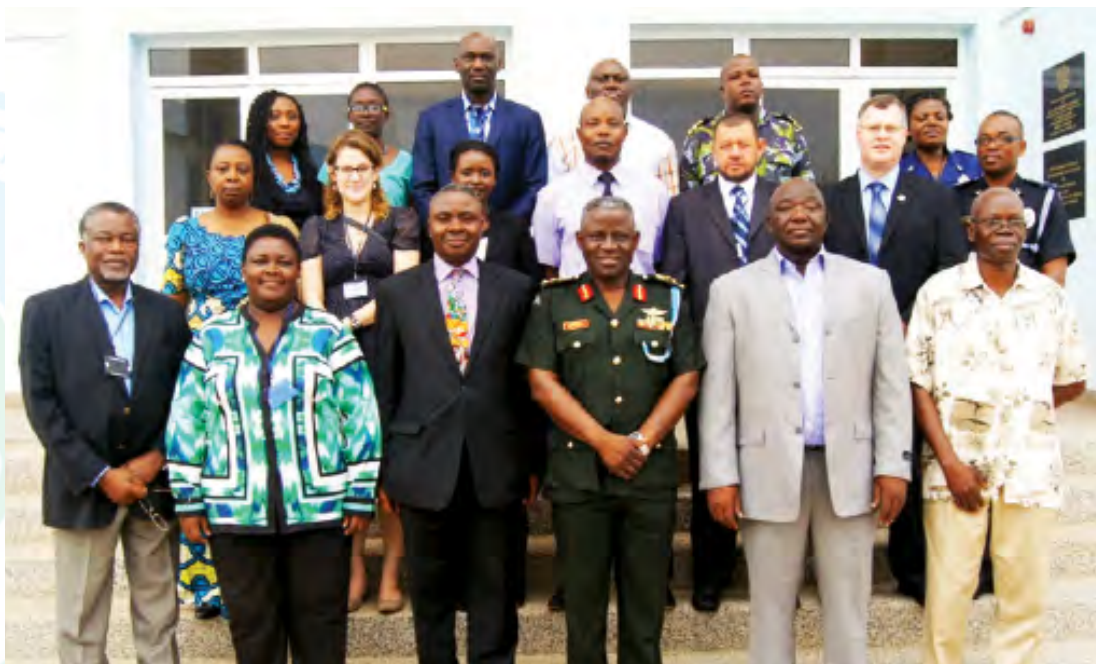
Police PDT Harmonisation Workshop, Accra, May 2014

Institutions, and the KAIPTC, which defrayed about six percent of the budget for the workshop.