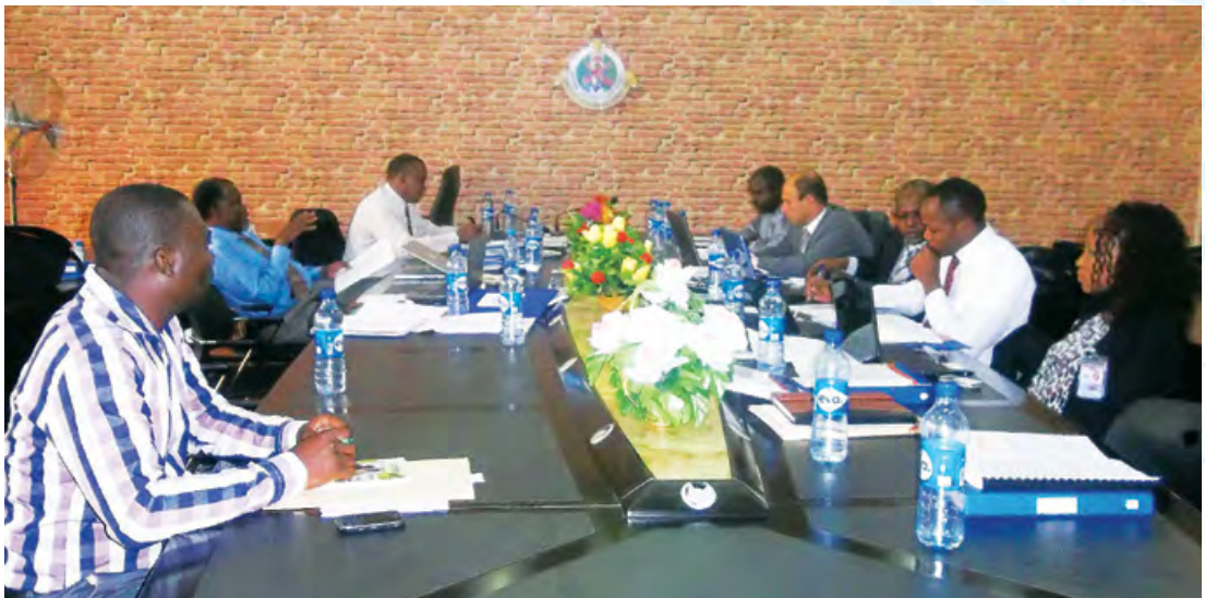
7 th Meeting and Launch of Annual Report

Further information on the work of the MANCO is provided in relevant sections of the Annual Report.