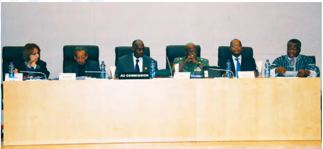
Session on Opening Ceremony

...gender training is a solid foundation to advance the goal of gender equality in peace and security operations in Africa, ultimately seeking to promote gender equality in UN and AU peacekeeping missions.