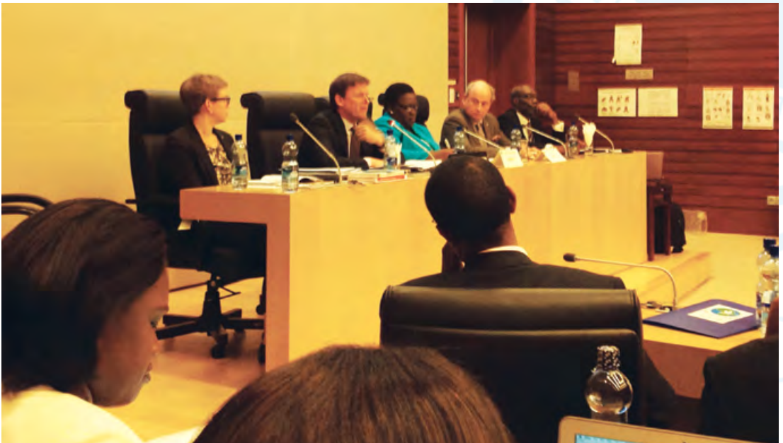
Session on African Training Architecture