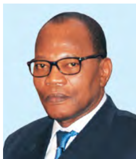
Amb. (Dr.) Mohamed Ibn Chambas - keynote speaker