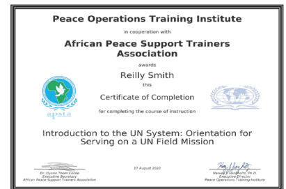
Example of a course certificate